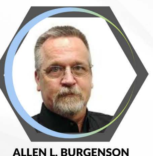
ASSOCIATE DIRECTOR, Global SME Testing (Virtual)